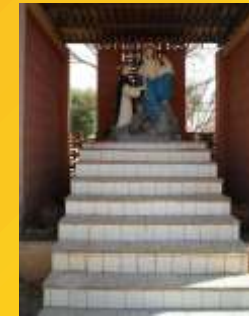
ROSARY SHRINE NOVENA

Let us extend this love to all, the poor and needy around us, especially, during this season of Lent.