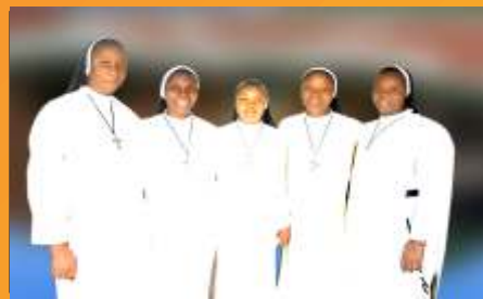
"Here I am Lord, I come to do your will"

application form online: www.domsistersnigeria.org